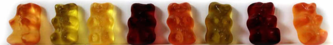
Author & Pictures: Jessica Wolf | Layout: Luce Pröll

Haribo celebrates its 100th anniversary with a special edition mix, the so-called Passport Mix. Unfortunately, it's not available in Germany, in fact it's only produced and sold in the United States. It features a combination of popular flavours and shapes from various countries and includes Crocs (France), Balla Balla (Spain/Portugal), Brix (Spain/Portugal), Rings (UK/Ireland), Cherries (Germany/US), Goldbears (Germany/US), Happy Cola (Germany/US) and Airplanes (limited-edition shape). Time to go online, folks.